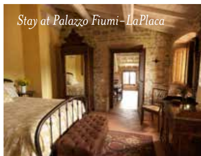
Stay at Palazzo Fiumi-LaPlaca